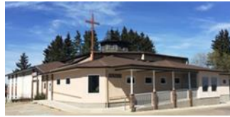
Rocky Mountain House