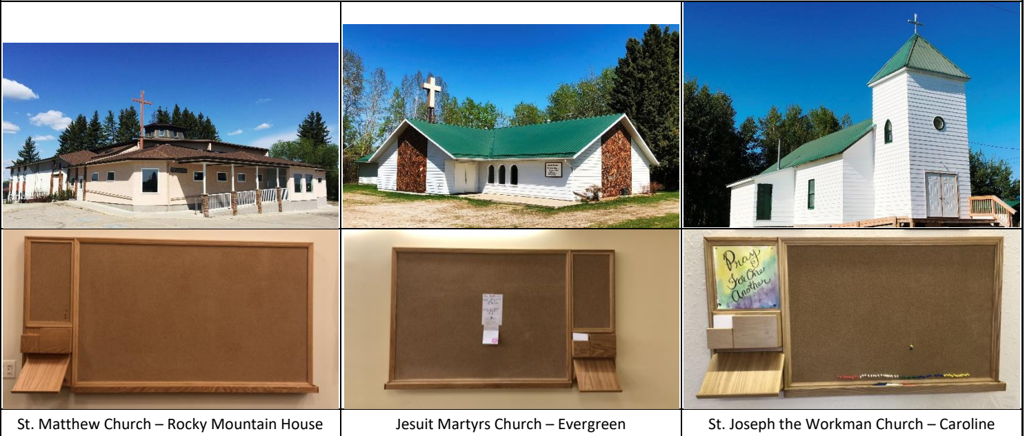
St. Matthew Church – Rocky Mountain House