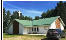
Evergreen - Jesuit Martyrs

Rocky Mountain House - St. Matthew Church Caroline - St. Joseph the Workman Church Evergreen - Jesuit Martyrs Church