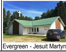
Evergreen - Jesuit Martyrs

Rocky Mountain House - St. Matthew Church Caroline - St. Joseph the Workman Church Evergreen - Jesuit Martyrs Church