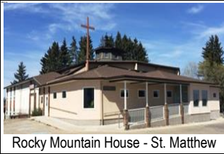
Rocky Mountain House - St. Matthew

March 11, 2018 - FOURTH SUNDAY IN LENT (B)