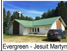
Evergreen - Jesuit Martyrs

Rocky Mountain House - St. Matthew Church Caroline - St. Joseph the Workman Church Evergreen - Jesuit Martyrs Church