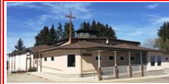
Rocky Mountain House