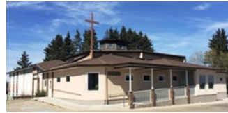
Rocky Mountain House