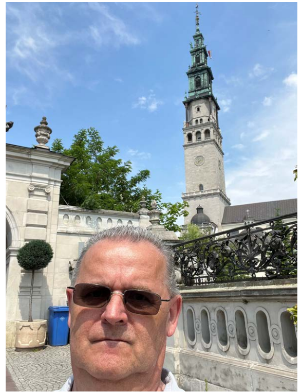
Pictures before the national shrine of Black Madonna in Czestochowa (Poland)