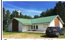
Evergreen - Jesuit Martyrs

Rocky Mountain House - St. Matthew Church Caroline - St. Joseph the Workman Church Evergreen - Jesuit Martyrs Church