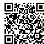
Bulletin QR Code