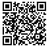
Bulletin QR Code