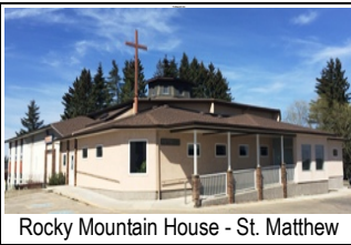
Rocky Mountain House - St. Matthew