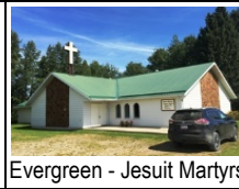
Evergreen - Jesuit Martyrs

Rocky Mountain House - St. Matthew Church Caroline - St. Joseph the Workman Church Evergreen - Jesuit Martyrs Church