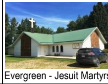
Evergreen - Jesuit Martyrs

Rocky Mountain House - St. Matthew Church Caroline - St. Joseph the Workman Church Evergreen - Jesuit Martyrs Church