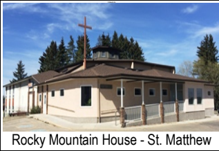
Rocky Mountain House - St. Matthew

January 10, 2021 – BAPTISM OF THE LORD (B)