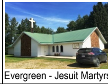
Evergreen - Jesuit Martyrs

Rocky Mountain House - St. Matthew Church Caroline - St. Joseph the Workman Church Evergreen - Jesuit Martyrs Church