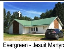
Evergreen - Jesuit Martyrs

Rocky Mountain House - St. Matthew Church Caroline - St. Joseph the Workman Church Evergreen - Jesuit Martyrs Church