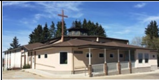
Rocky Mountain House