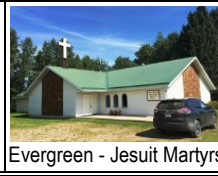
Evergreen - Jesuit Martyrs

Rocky Mountain House - St. Matthew Church Caroline - St. Joseph the Workman Church Evergreen - Jesuit Martyrs Church