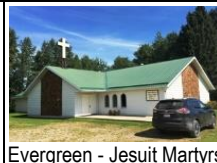
Evergreen - Jesuit Martyrs

Rocky Mountain House - St. Matthew Church Caroline - St. Joseph the Workman Church Evergreen - Jesuit Martyrs Church