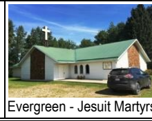
Evergreen - Jesuit Martyrs

Rocky Mountain House - St. Matthew Church Caroline - St. Joseph the Workman Church Evergreen - Jesuit Martyrs Church