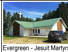
Evergreen - Jesuit Martyrs

Rocky Mountain House - St. Matthew Church Caroline - St. Joseph the Workman Church Evergreen - Jesuit Martyrs Church