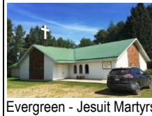
Evergreen - Jesuit Martyrs

Rocky Mountain House - St. Matthew Church Caroline - St. Joseph the Workman Church Evergreen - Jesuit Martyrs Church